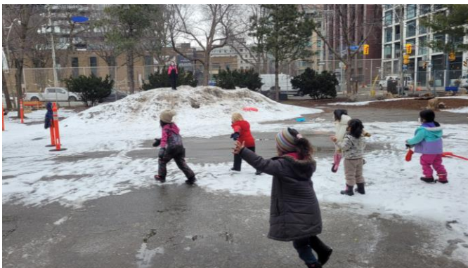
Outdoor Fun with Giant Frisbee