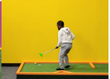
Mini Golf at Fun City