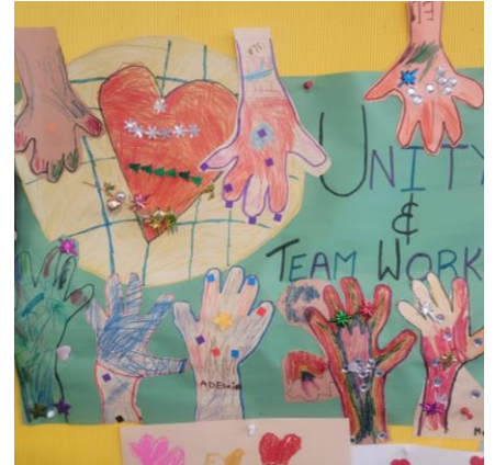
Team Work How Can We Help Each Other?